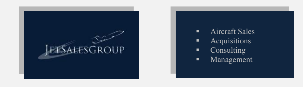
Another Step Closer To Your Dreams!

Aircraft offered subject to prior sale or withdrawal from market. Specifications subject to verification by Purchaser